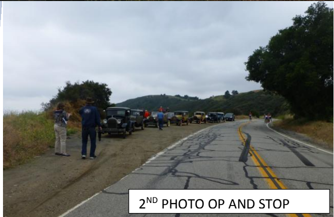
2ND PHOTO OP AND STOP