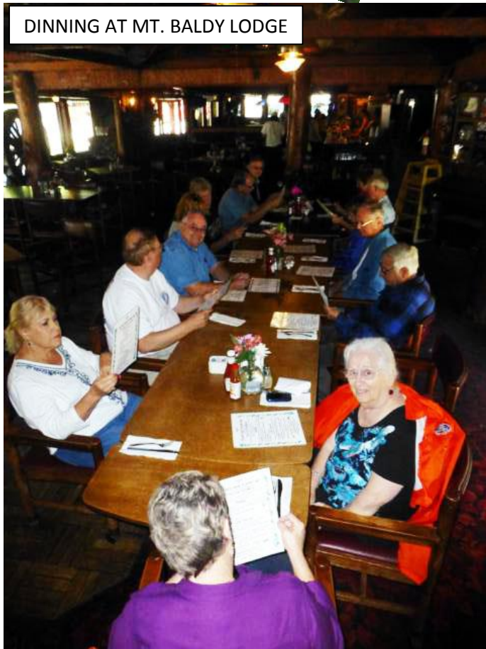
DINNING AT MT. BALDY LODGE