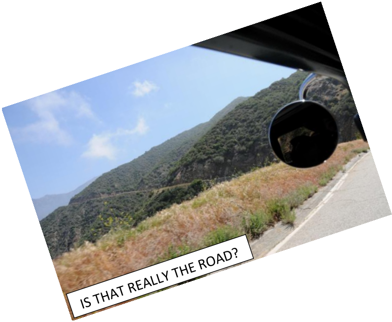
IS THAT REALLY THE ROAD?