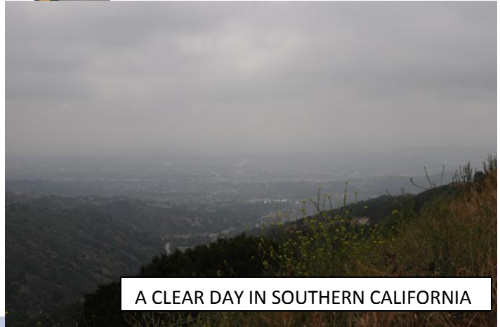
A CLEAR DAY IN SOUTHERN CALIFORNIA