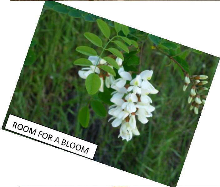
ROOM FOR A BLOOM