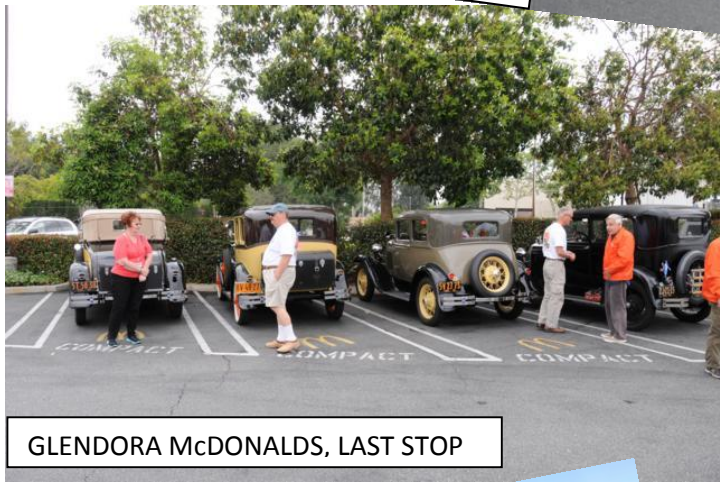
GLENDORA McDONALDS, LAST STOP