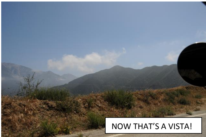
NOW THAT'S A VISTA!