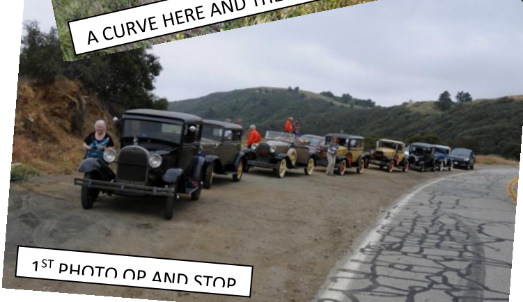
1ST PHOTO OP AND STOP