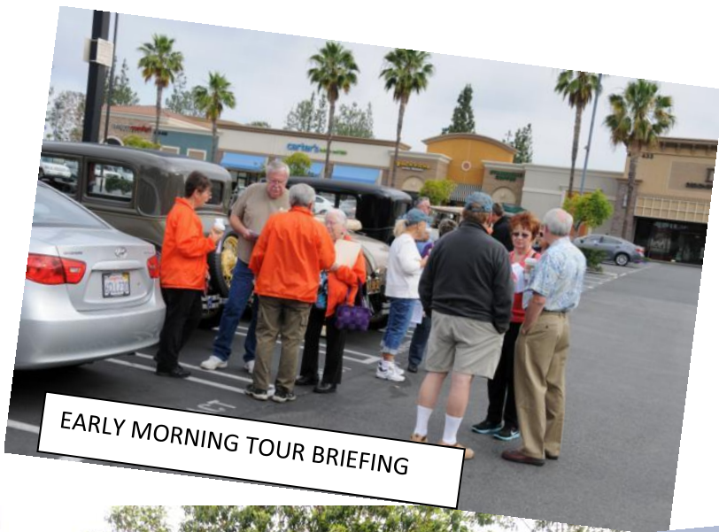
EARLY MORNING TOUR BRIEFING