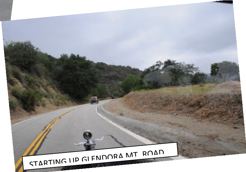
STARTING UP GLENDORA MT ROAD