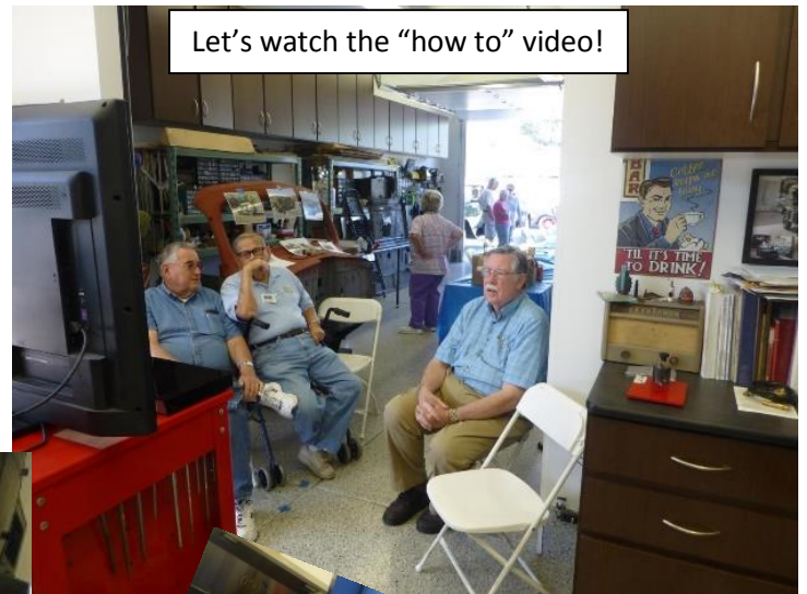
Let's watch the "how to" video!