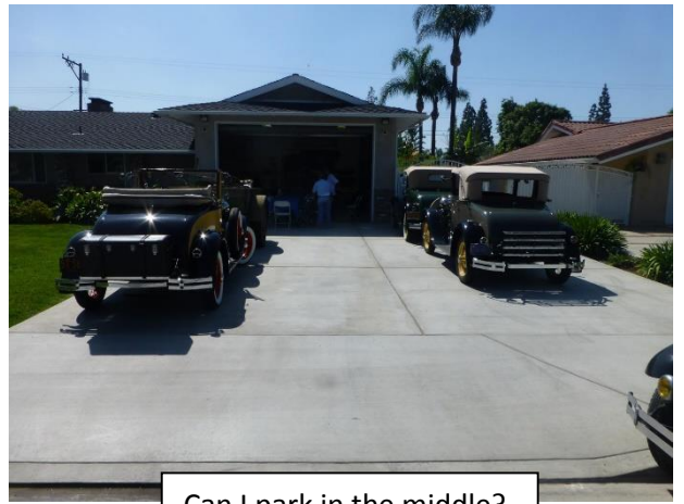
Can I park in the middle?