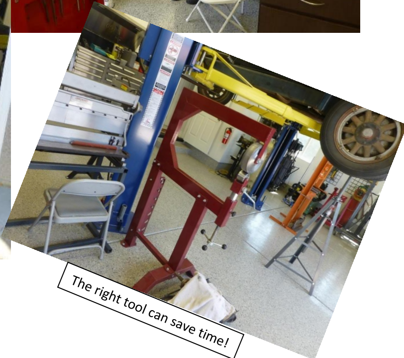
The right tool can save time!