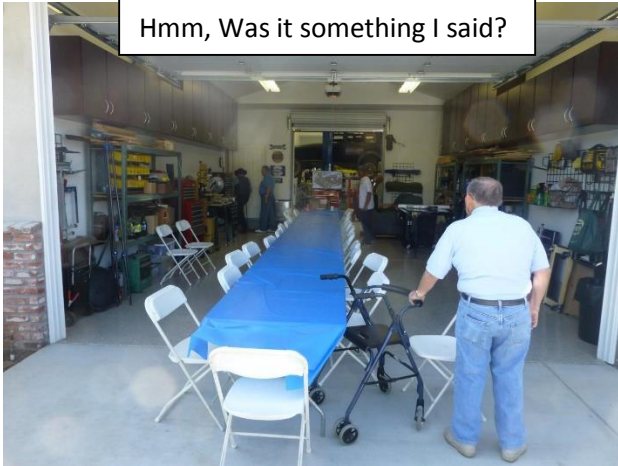
Hmm, Was it something I said?