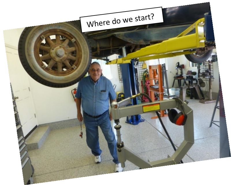
Where do we start?