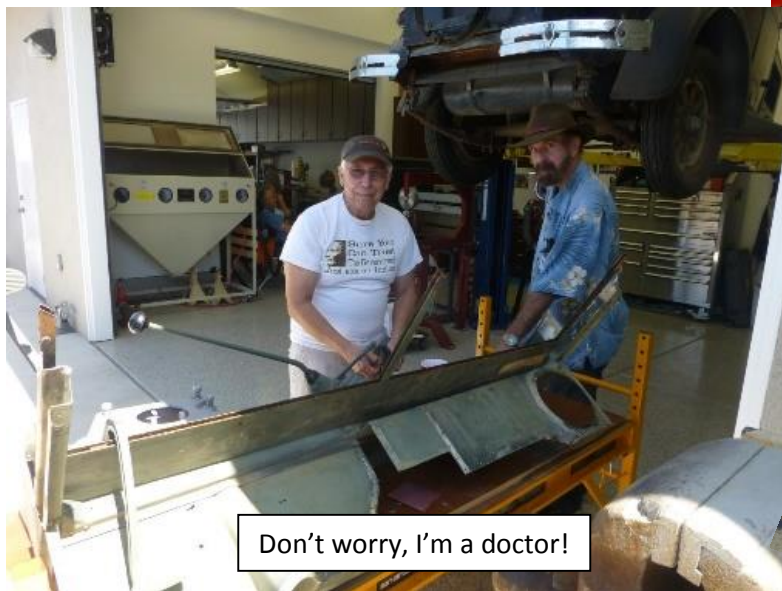
Don't worry, I'm a doctor!