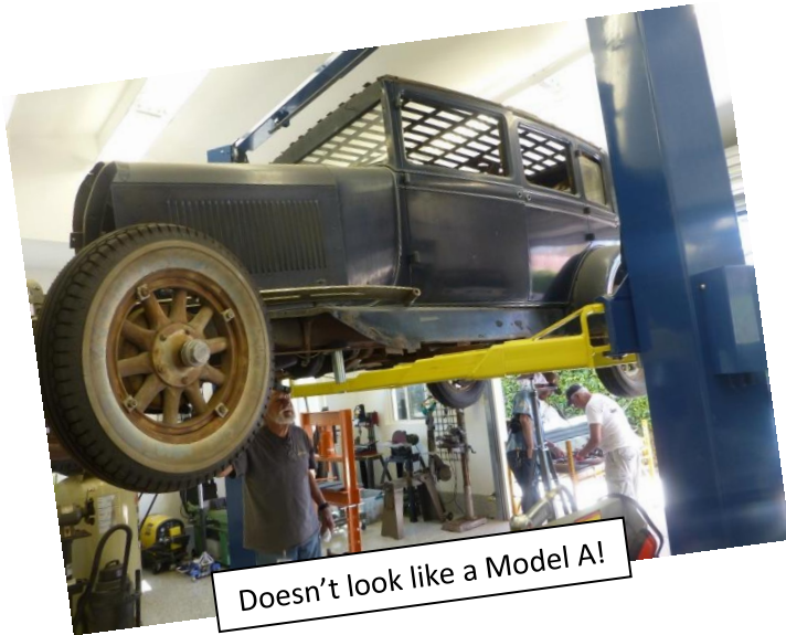
Doesn't look like a Model A!