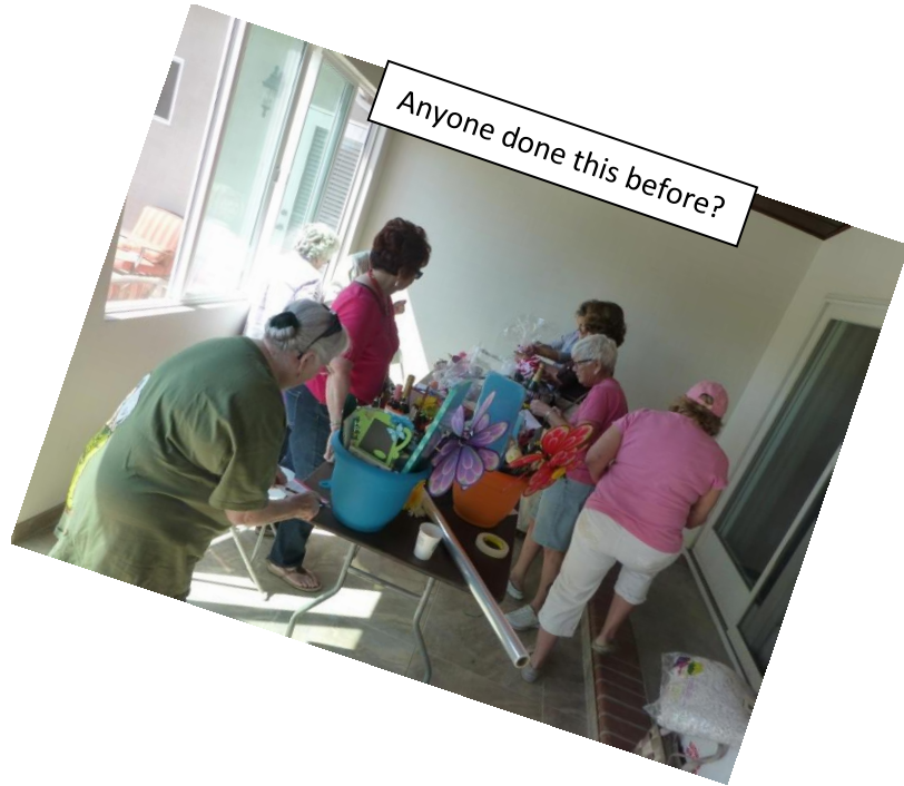
Anyone done this before?