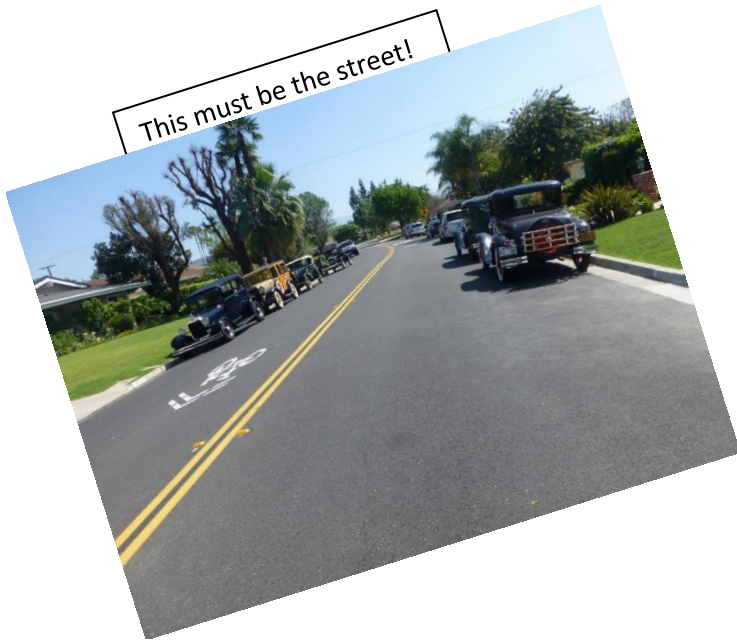
This must be the street!