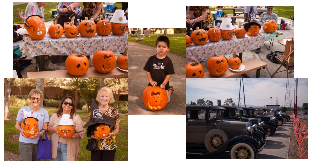
Page 8 Orange County Model A Distributor Volume 49 #11 November 2009